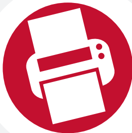
Epson Stylus CX9400Fax