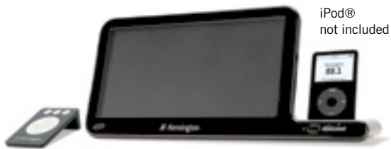
iPod® not included

I would like to receive future promotional offers from ACCO Brands/Quartet® Yes No